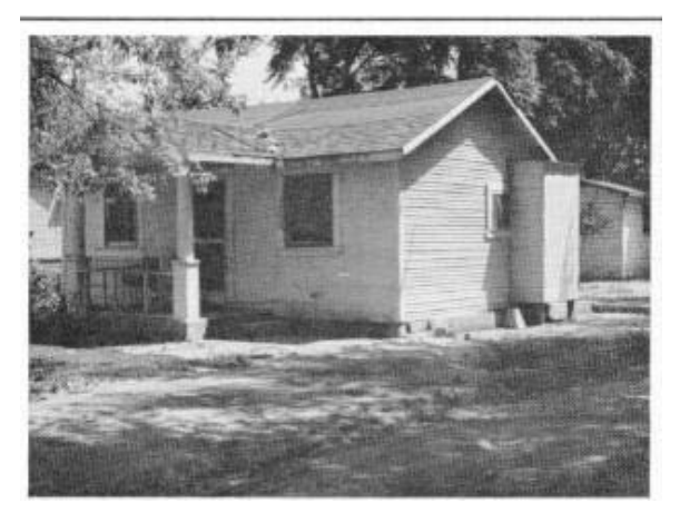
Gardenland home in the 1960's.

In 1926, the town of North Sacramento and the County of Sacramento approved the subdivision of Gardenland. The original subdivision map boundaries are Wilson Avenue to the North, Columbus Avenue and the Reclamation 1000 Levee to the South, Lower Marysville Road (which was later renamed to Northgate Boulevard) to the West, and the Reclamation District 1000 Levee to the East. Gardenland began its transformation from a rural agriculturally-driven community to a more urban community.