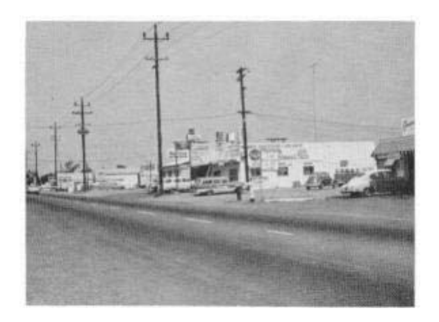
Northgate Boulevard in the 1960's

In the 1950's Northgate Boulevard, which bisects the Northgate and Gardenland neighborhoods, became the transportation route for McClellan Air Force Base. Supplies were shipped up the Sacramento River to an Air Force dock off the Garden Highway and then transported to McClellan via Northgate Blvd. Northgate Boulevard was widened to accommodate the increase in traffic, thus creating the commercial corridor that exists today.