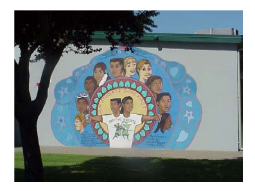
Mural at Smythe School

The Action Plan addresses the need for traffic improvements in front of Smythe School on Northgate Boulevard, and at the intersection of West El Camino and Northview drive; both of these projects are currently underway, though the scope of the work is still being discussed. The improvement of circulation for both pedestrians and vehicles at both of these intersections will be greatly beneficial to the Gardenland-Northgate community and the elementary age children that attend school in the area.