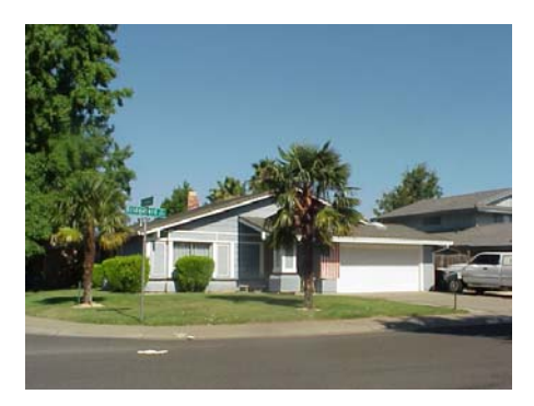
House in Northgate neighborhood

An important priority of the community is to encourage the development of infill housing on the many vacant residential lots in the Gardenland neighborhood. The SNAP includes actions to encourage infill development through incentives that reduce development and impact fees, by exploring developer interest in building self-help housing projects in the area, and the sale of surplus, city-owned land for housing development. Additional survey work will be done to determine barriers to development that may exist in the area, as well as the general sentiment of the community regarding preferred housing types and the subdivision of deep lots.