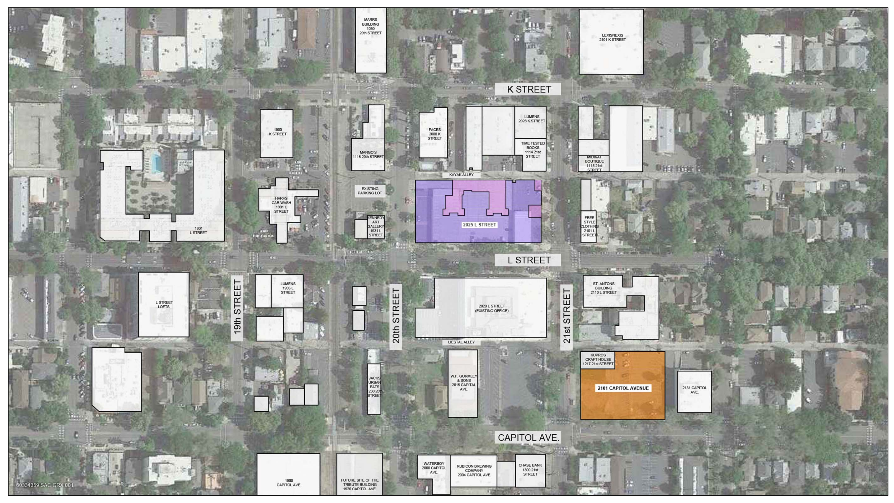
Exhibit 2. Project Location