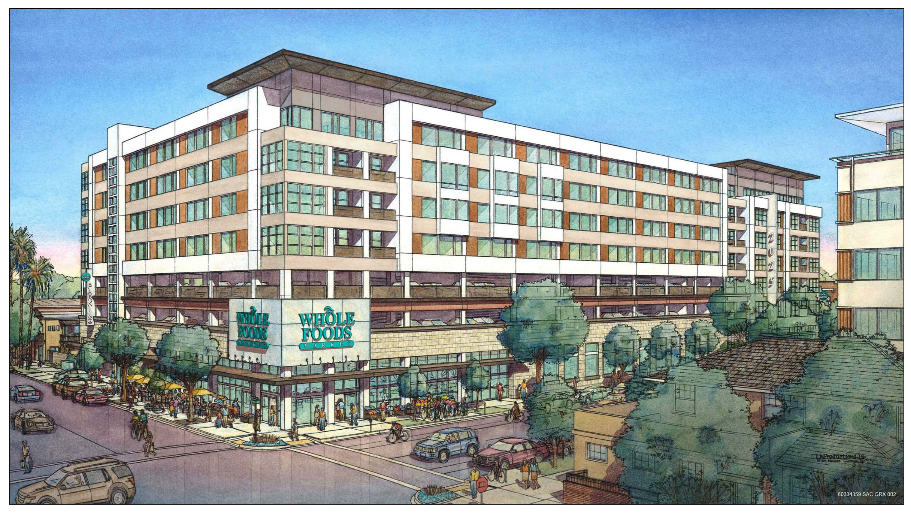
Exhibit 3. View of 2025 L Street Looking Northeast from the Intersection of L and 20th Streets