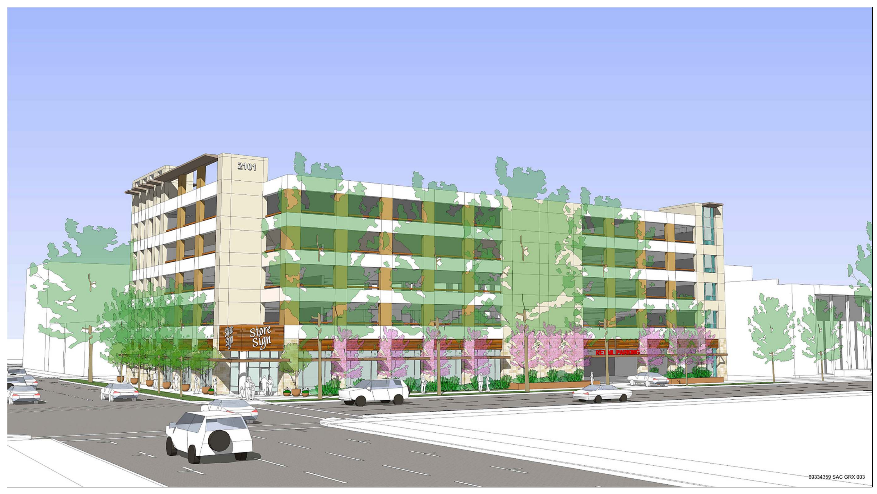
Exhibit 4. View of 2101 Capitol Avenue Ground Floor Retail Space and Parking Structure Looking Northeast from 21st Street toward Capitol Avenue