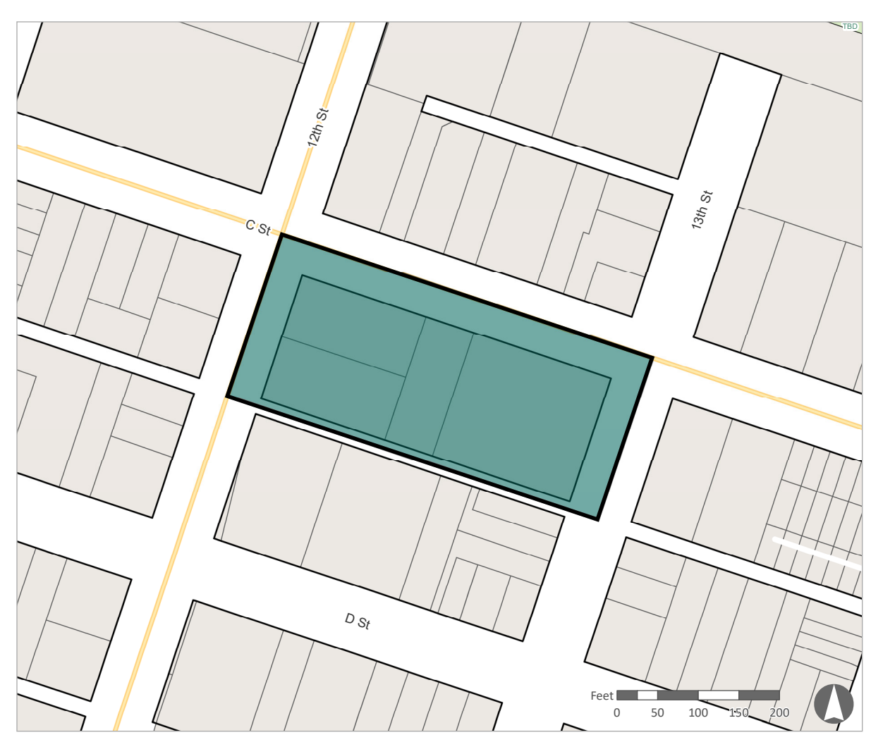
Figure 84. Map of the C Street Commercial Historic District.

To view the statuses of individual properties as contributing or non-contributing resources to the historic district, refer to the Sacramento Register of Historic and Cultural Resources.