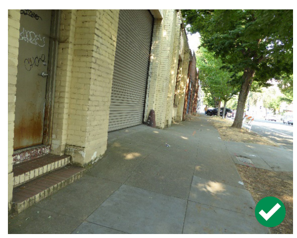
Figure 85. Contributing buildings in the historic district have a zero-lot-line setback.