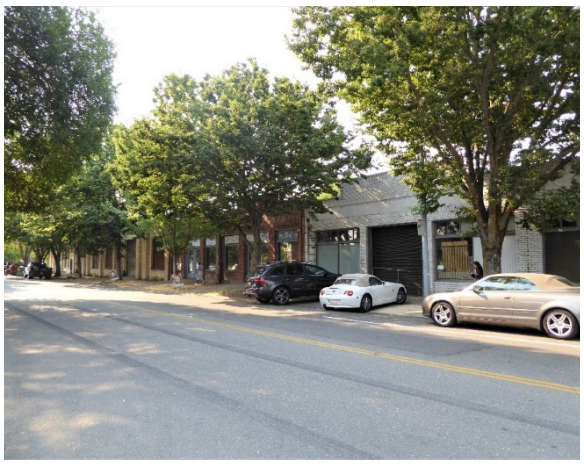
Figure 80. A row of One-Block Commercial Block type buildings creates a cohesive grouping on the south side of C Street between 12^{\rm th} and 13^{\rm th} streets.

The C Street Commercial Historic District is located in the northwest corner of Sacramento's original 1848 street grid. The district is comprised of a collection of early to mid-twentieth-century commercial buildings that are situated along C Street between 12<sup>th</sup> and 13<sup>th</sup> streets.