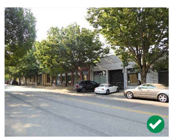
Figure 86. The pattern of wide window and door openings facing the street is a key characteristic of the historic district.