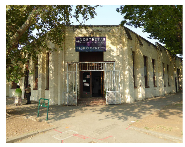
Figure 81. A former warehouse with a corner entrance faces the intersection of C and 13^{\rm th} streets.