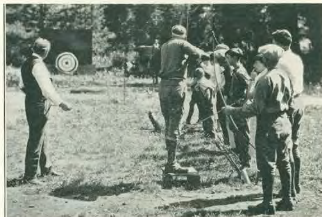
The bulls eye is the target for many hours of sport. Children and adults alike spend hours at the archery range.