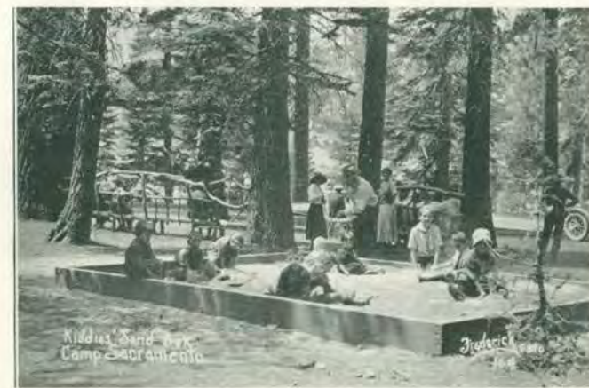
The sand box, swings and other equipment on the Children's Playground afford many happy hours for the little tots.