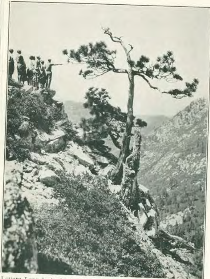
Lovers Leap looks high, and it is high, but it is a comparatively easy hike from camp.