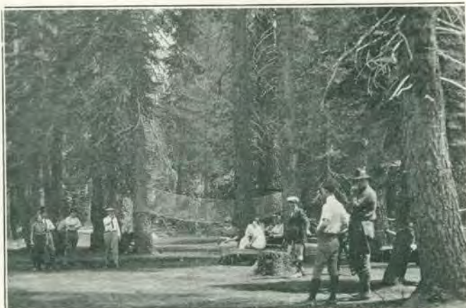
The courts of the iron shoes are kept busy from morning until night by the campers.