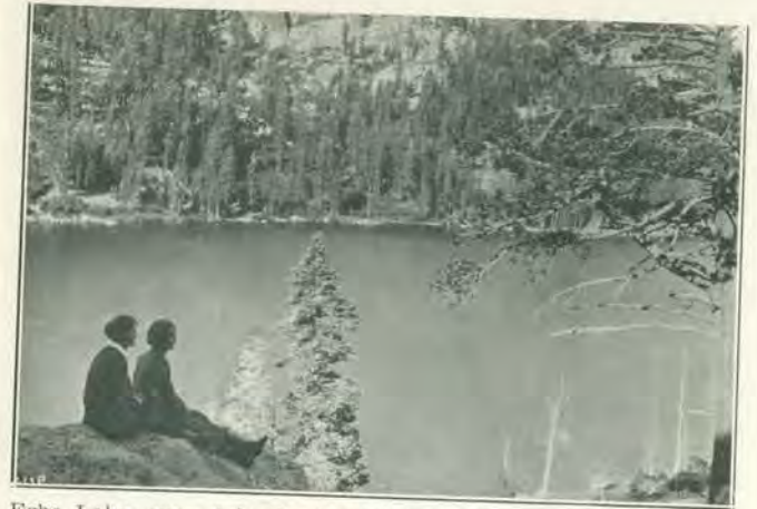
Echo Lake, cupped in the "hills," is a mirror for the sky, and is often spoken of as a "mountain gem." Here one may indulge in happy moods, hike along the rugged shores, visit the weird cabin and grounds of the hermit, or sit and talk with friends.