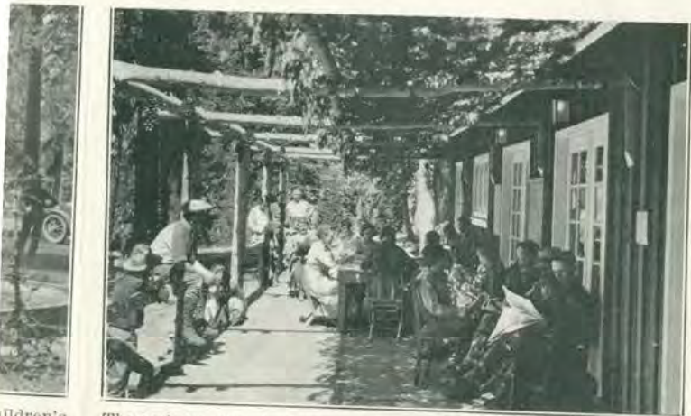
children's tots. Throughout the day campers frequent the front porch of the main building to read, write letters, and talk with friends.