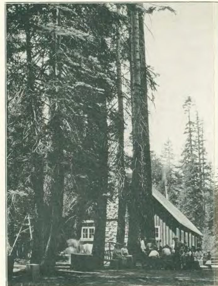
The above picture shows the place which is the center of Camp Sacramento, the place of welcome to guests and friends, the shady playground, this point also one of the finest views of the