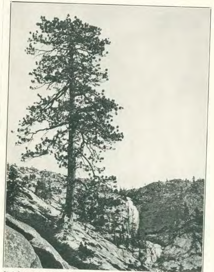
It takes a real hiker to make the trip to Horse-tail Falls, but one is well repaid for the effort.