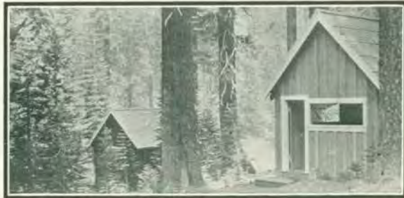
Typical One-Room Cabins.