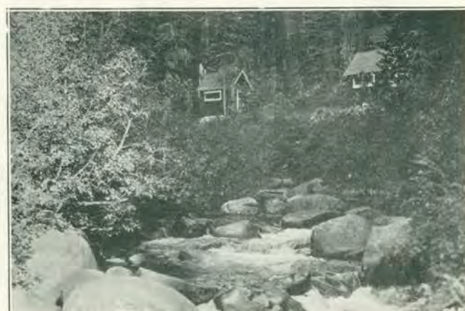
The cabins along the river are so located as to give one an unobstructed view of the stream.