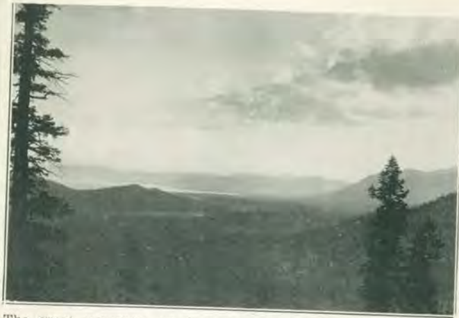
The great panorama of snow-capped peaks, rugged mountain walls, thousands of giant pines, the green valley floor, and Lake Tahoe with its blue and emerald shades, greets one from the summit.