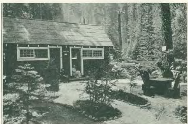
This view of the two-room cabin is typical of many others which are located among the giant pines.