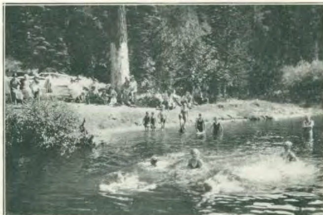
Swimming is safe at Camp Sacramento. The river is not too shallow and not too deep.