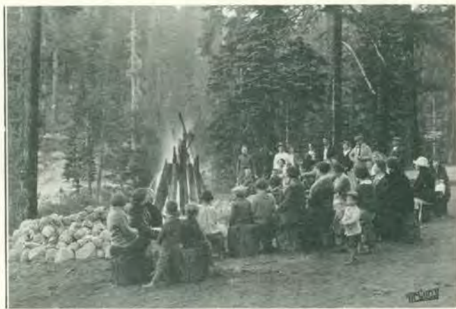
This is the place to tell old jokes, ghost stories, sing, do stunts and fuse friendships.