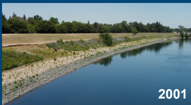
Erosion protection near CSUS with on-site mitigation completed in 2001

Twitter: www.twitter.com/USACEsacramento