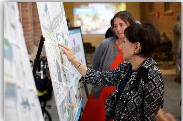
Congresswoman Doris Matsui