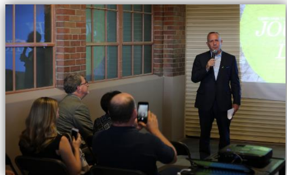
Mayor Darrell Steinberg