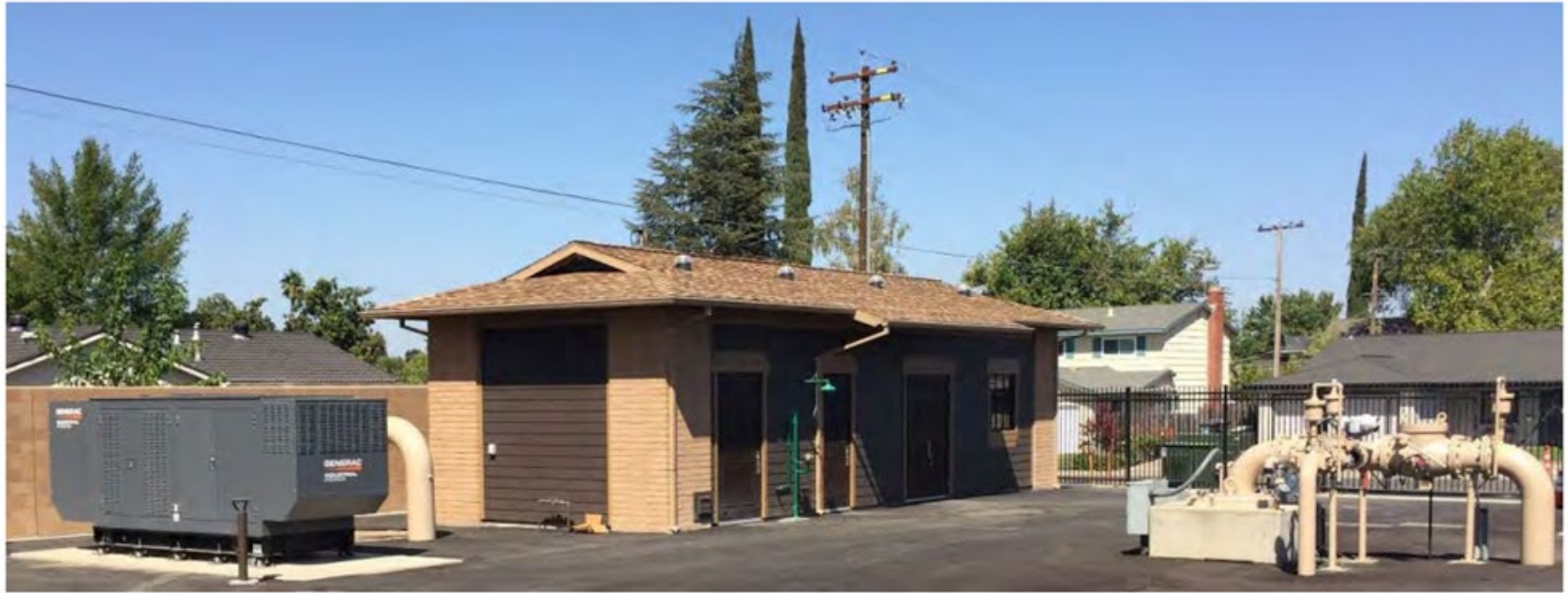
Figure 3: Example of an Existing Well Site