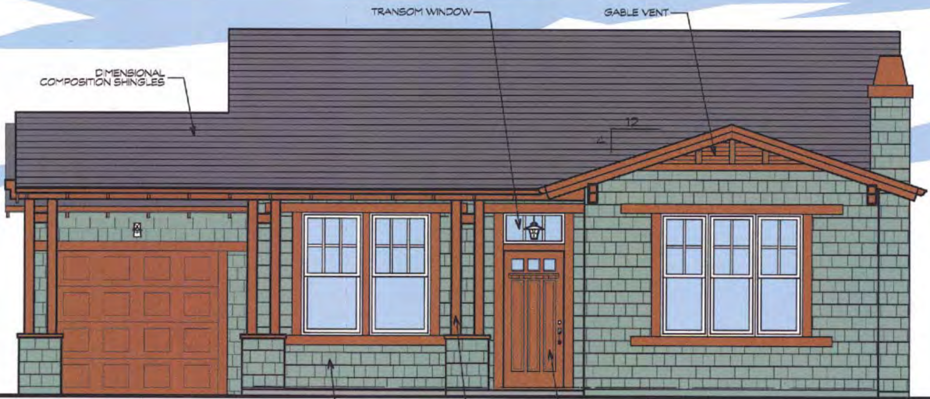
SCHEME - 2 1/4" = 1'-0"

CRAFTSMAN STYLE FRONT DOOR WITH GLASS PANELS