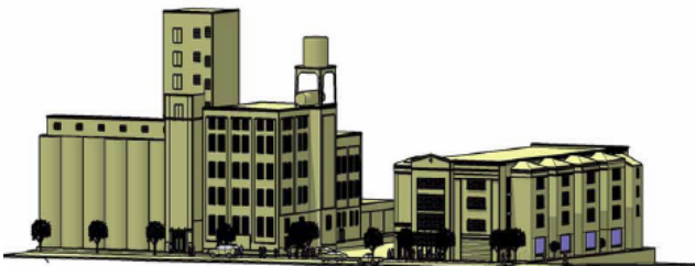
created by nitisha gilra, 2005 applied architecture inc