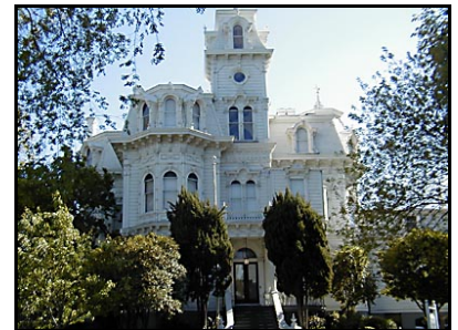
1530 "H" Street