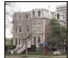
704 "O" Street