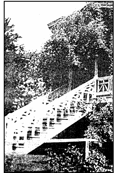
Original stair railing, Winn Park Historic District