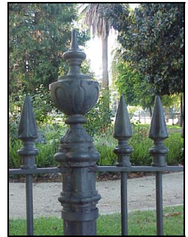
Crocker Gallery Fencing