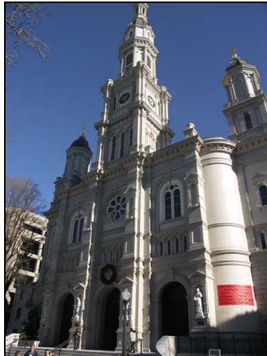
More Cathedral... Exterior

Note, some dates for completion/hearings not set pending receipt of additional information, research, plans or drawings, fees, or other reviews.