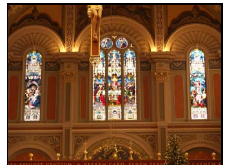
Stained glass windows