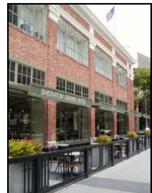
Brick, terra cotta and steel sash windows