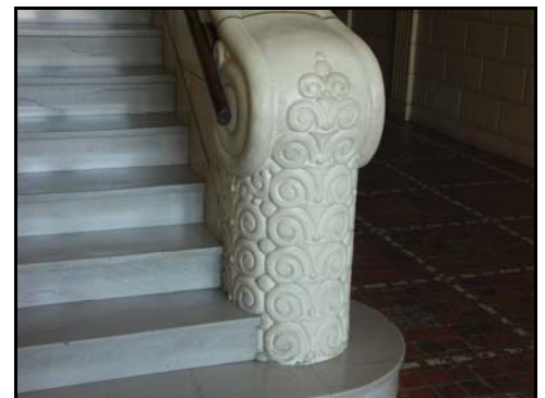
Masonic Temple (1920) 1123 "J" Street