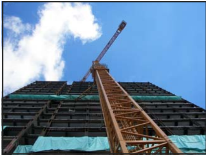
A skyward glimpse of 621 Capitol Mall, currently under construction.

With its 400-foot shell under construction, it's hard to miss the silhouette of 621 Capitol Mall when you look at downtown Sacramento's skyline. The 25-story office building, also known as the U.S. Bank Building, began in 2004.