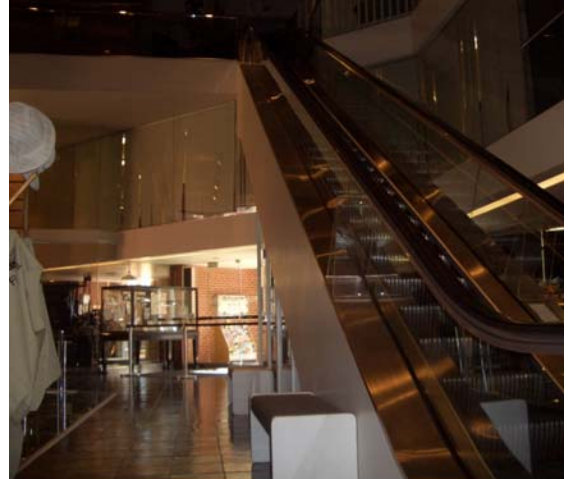
New Escalator at the Sacramento History Museum