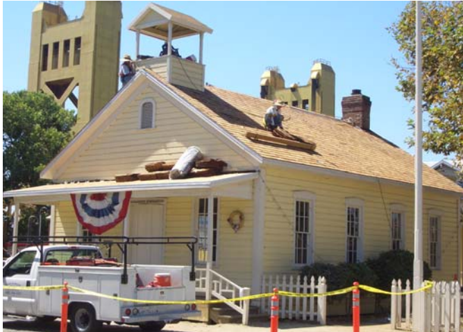
New Roof at the Old Sacramento Schoolhouse