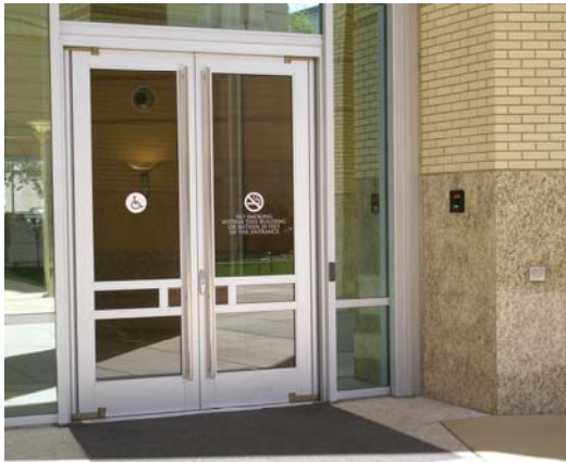
ADA Access to New City Hall