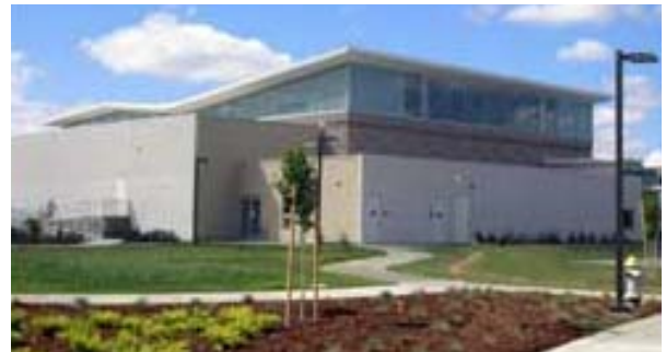
George Sim Community Center