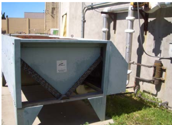
Sacramento Drill Tower HVAC 1 (before) 1 Heating, Ventilating, and Air Conditioning