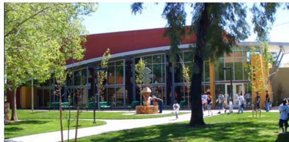
Oak Park Community Center Gym