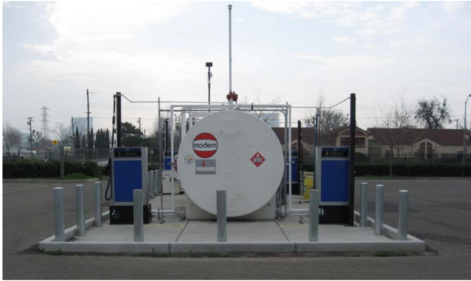
Recently Completed Fueling Facility at 300 Richards Boulevard