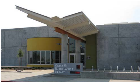
Valley Hi – North Laguna Library

FY2010/11 should bring the completion of the City’s Community Reinvestment Capital Improvement Program (CRCIP) Tier I list of approved projects. Staff will return to the City Council for discussion on any remaining project funds as the final projects are completed. The following pictures represent a few of the new facilities completed with these funds: