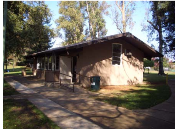
ADA Restroom in East Portal Park Restroom