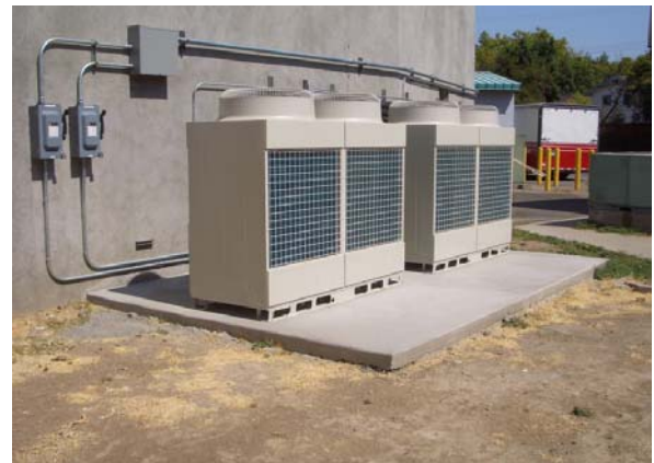
Sacramento Drill Tower HVAC (after)