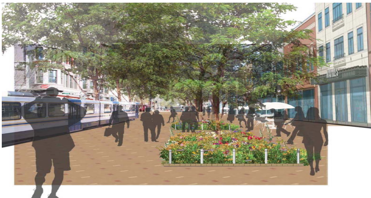
K Street Streetscape (Artist's Rendition)

The K Street Streetscape Project will make improvements to the K Street Mall (Mall) and Regional Transit (RT) stations on K Street, between 7 th and 12 th Streets, and St. Rose of Lima Park. Planned improvements will include new and consistent paving materials, street furniture, trash receptacles, landscaping, lighting, enhanced intersection treatments, gateway elements and an interactive water feature at St. Rose of Lima Park. In an effort to strengthen transit connections, the Project also includes relocating an existing platform from the 700 block to the east side of 7 th Street, just south of the K-L alley and the existing 1000 block mini-high platform down one block to the north side of the 1100 block. Currently, phase one of the project is funded and will soon start construction. Phase one includes improvements on the 700 block, ST. Rose of Lima and the new 7 th Street RT Station. The key objectives are to: aesthetically improve the corridor, increase safety for pedestrians, enhance transit stops and connection to RT stations, strengthen pedestrian lighting, build connectivity, improve pedestrian mobility, and to create a safe and inviting public space.