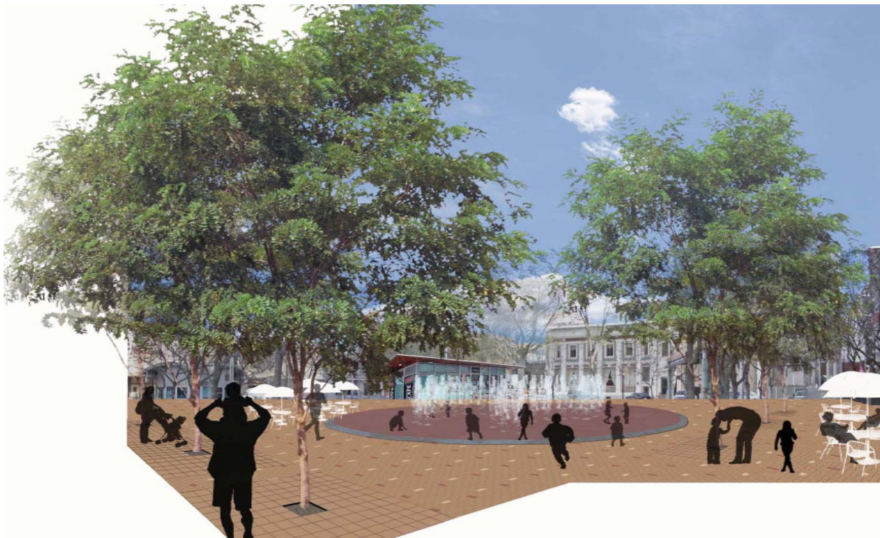
K Street Streetscape (Artist's Rendition)