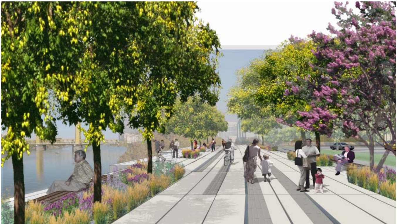
K Street Streetscape (Artist's Rendition)