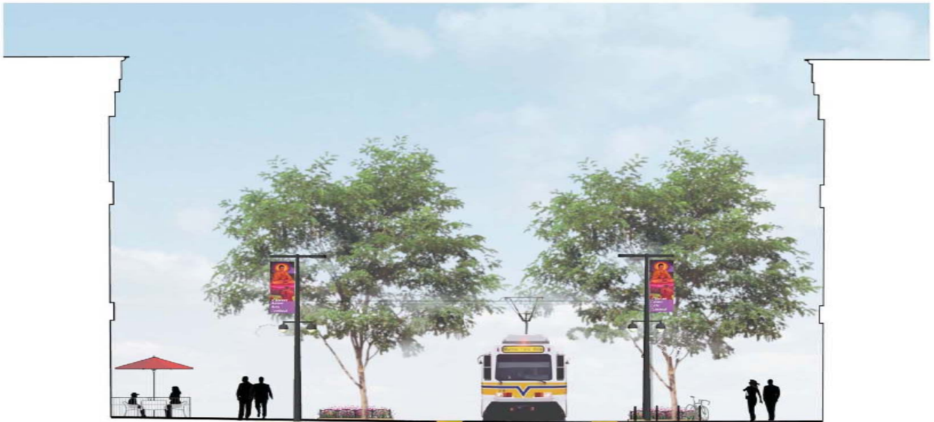
K Street Streetscape (Artist's Rendition)