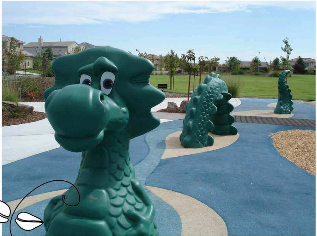
California Lilac Park