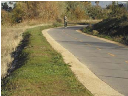
12' Wide Trail with Shoulder