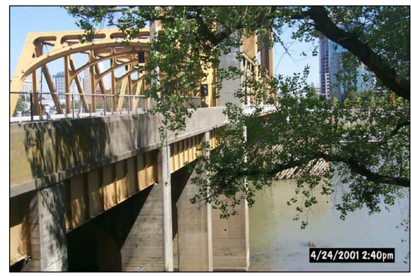
SOUTHWEST APPROACH FACING EAST