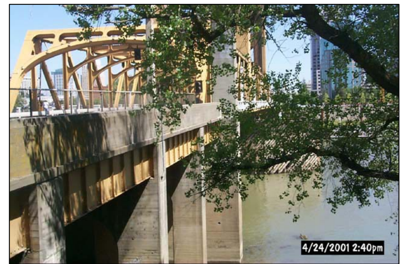
SOUTHWEST APPROACH FACING EAST