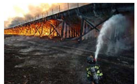
The Sacramento Fire Department responding to a fire emergency along a 300-foot stretch of an elevated Union Pacific railroad trestle.

PHS 4.1.1 Multi-Hazard Emergency Plan. The City shall maintain and implement the Multi-Hazard Emergency Plan to address disasters such as earthquakes, flooding, dam or levee failure, hazardous material spills, epidemics, fires, extreme weather, major transportation accidents, and terrorism. (MPSP)