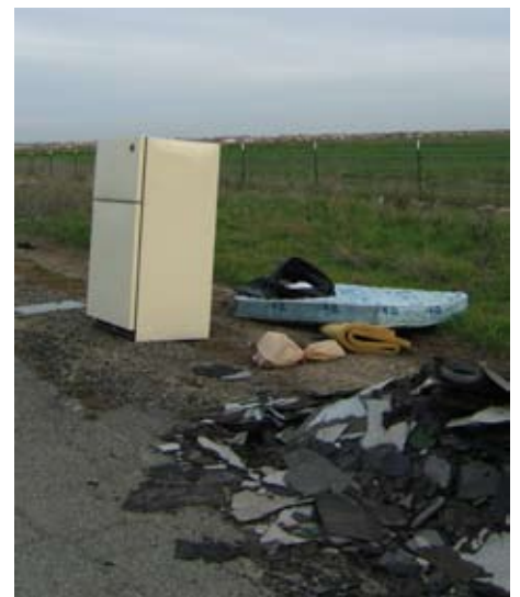
Trash illegally dumped along a Sacramento roadway.