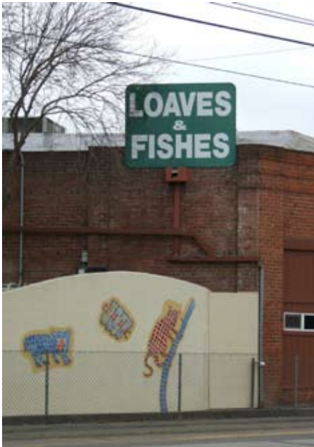
Opened in 1983, Sacramento Loaves & Fishes feeds the hungry and shelters the homeless, providing a welcoming, safe, and clean facility for homeless men, women and children with human service needs.

See M 2, Walkable Communities, and M 5, Bikenways, for policies addressing walkable neighborhoods and bike facilities.