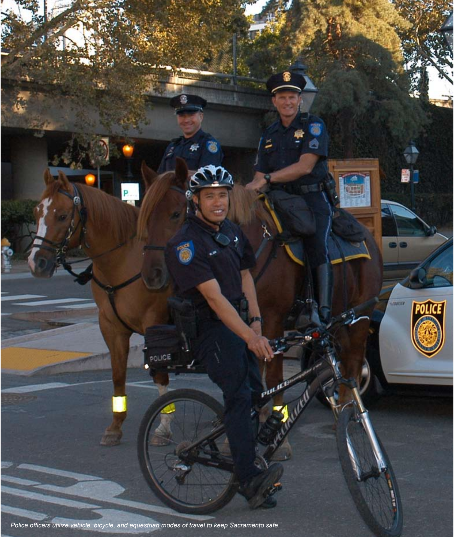
Police officers utilize vehicle, bicycle, and equestrian modes of travel to keep Sacramento safe.