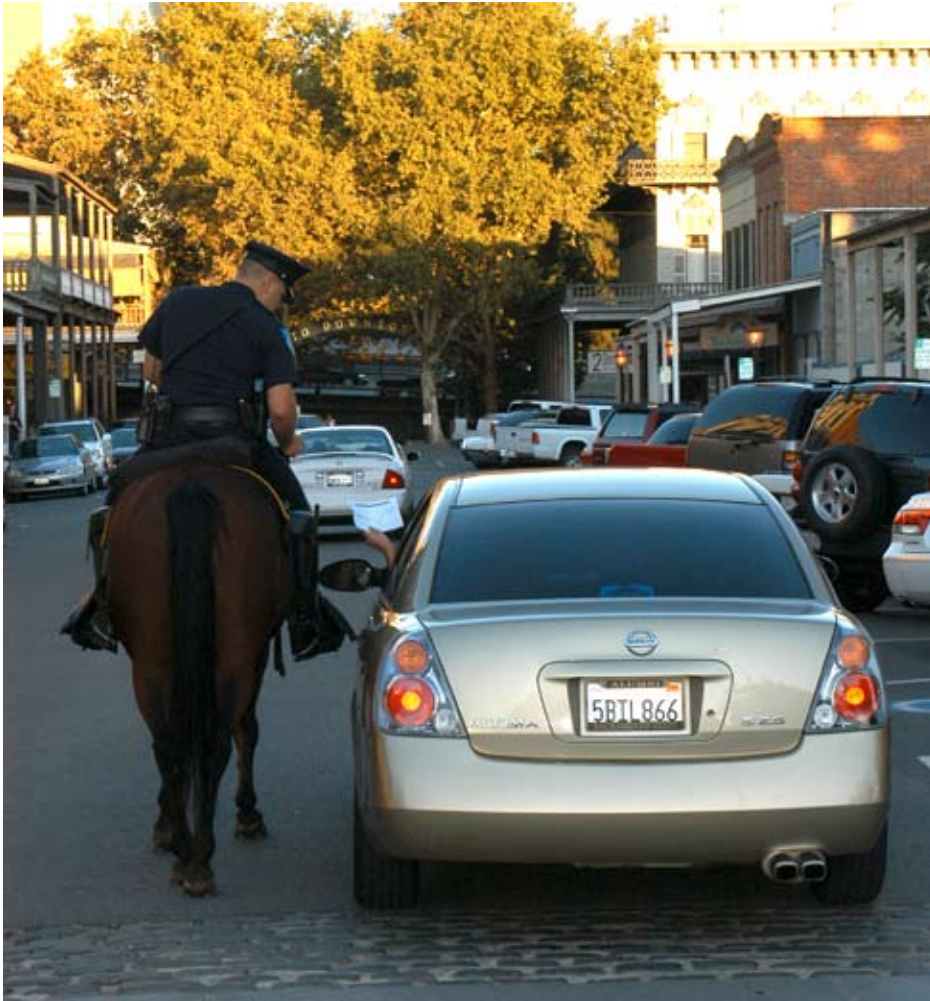
Police officer on horseback communicating with a visitor to Old Sacramento.

PHS 1.1.12 Cooperative Delivery of Services. The City shall work with local, State, and Federal criminal justice agencies to promote regional cooperation in the delivery of services. (IGC)