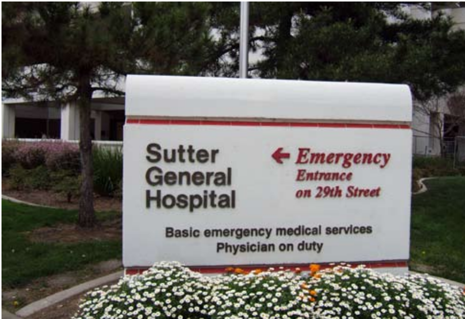
Sutter General Hospital is located in midtown Sacramento and provides medical services.

Policies in this section support the County of Sacramento as the principal provider of health and human service facilities and services. Programs to address the special needs of the disabled, homeless, and senior populations will be supported. A healthy and active lifestyle for Sacramento residents will be encouraged to improve overall public health.