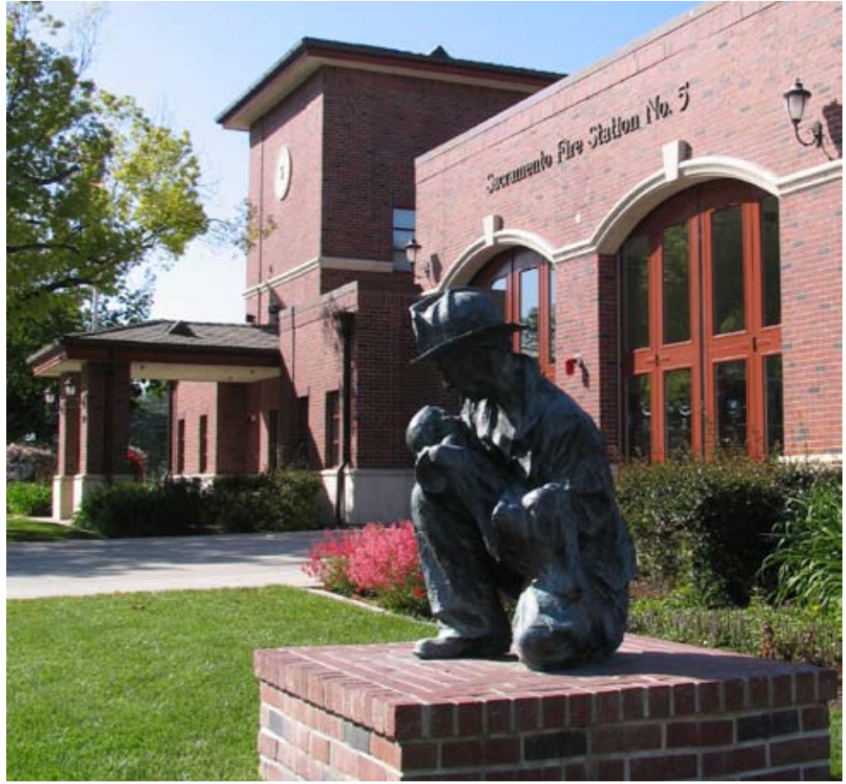
Fire Station No. 5, located on Broadway in the O'Neil Park neighborhood.