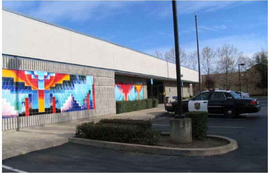
South Area Police Substation.

PHS 1.1.5 Distribution of Facilities. The City shall expand the distribution of police substation type facilities to allow deployment from several smaller facilities located strategically throughout the city and provide facilities in underserved and new growth areas in order to provide appropriate response to all city residents. (MPSP)