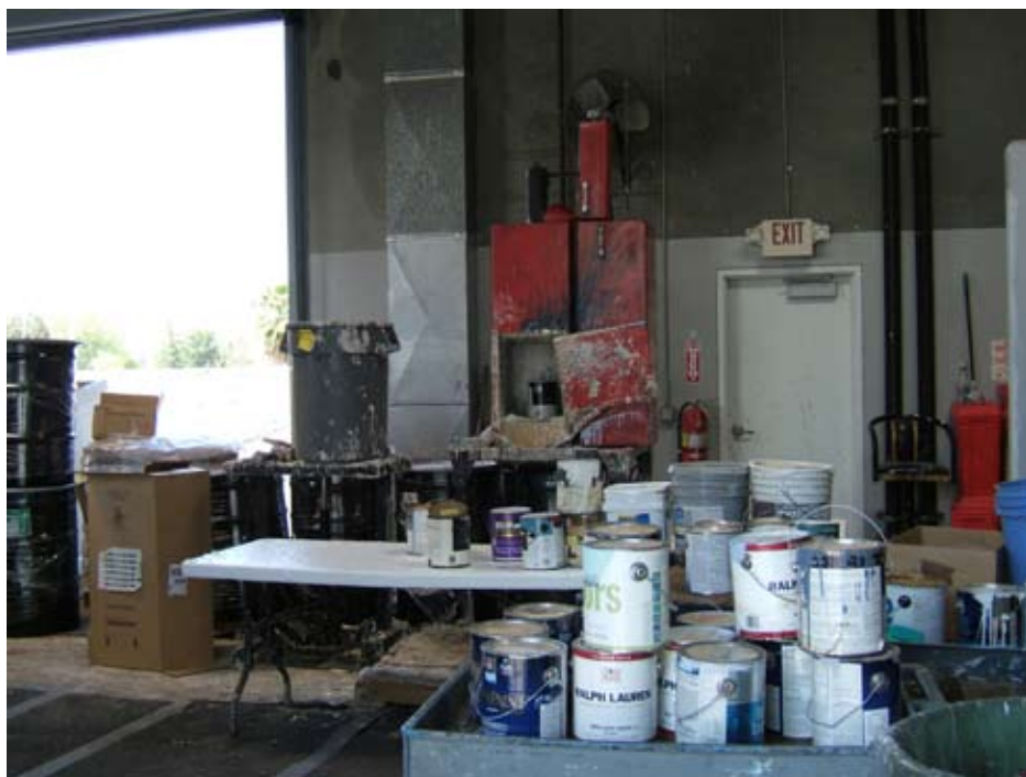
Sacramento Recycling and Transfer Station disposal site for household hazardous waste.

Policies in this section continue practices for the documentation, monitoring, clean up, and re-use of hazardous materials and sites. In addition to their contribution to the safety and well-being of residents, businesses, and visitors to Sacramento, these actions are important contributors to the reduction of surface and groundwater pollution, air pollution, and greenhouse gases.