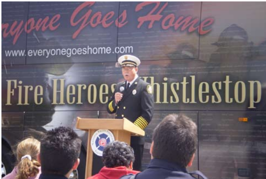
Former Sacramento Fire Chief.