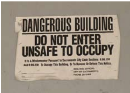
Dangerous building cited with code violations.

PHS 6.1.7 Deterioration, Blight, and Deferred Maintenance. The City shall require that housing units are maintained to ensure a safe and healthy living environment, preventing blight and deterioration resulting from deferred maintenance. (RDR)