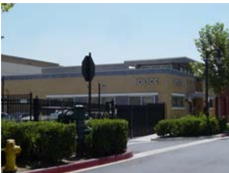
North Area Police Substation.

See the Land Use and Urban Design Element for policies related to development design.