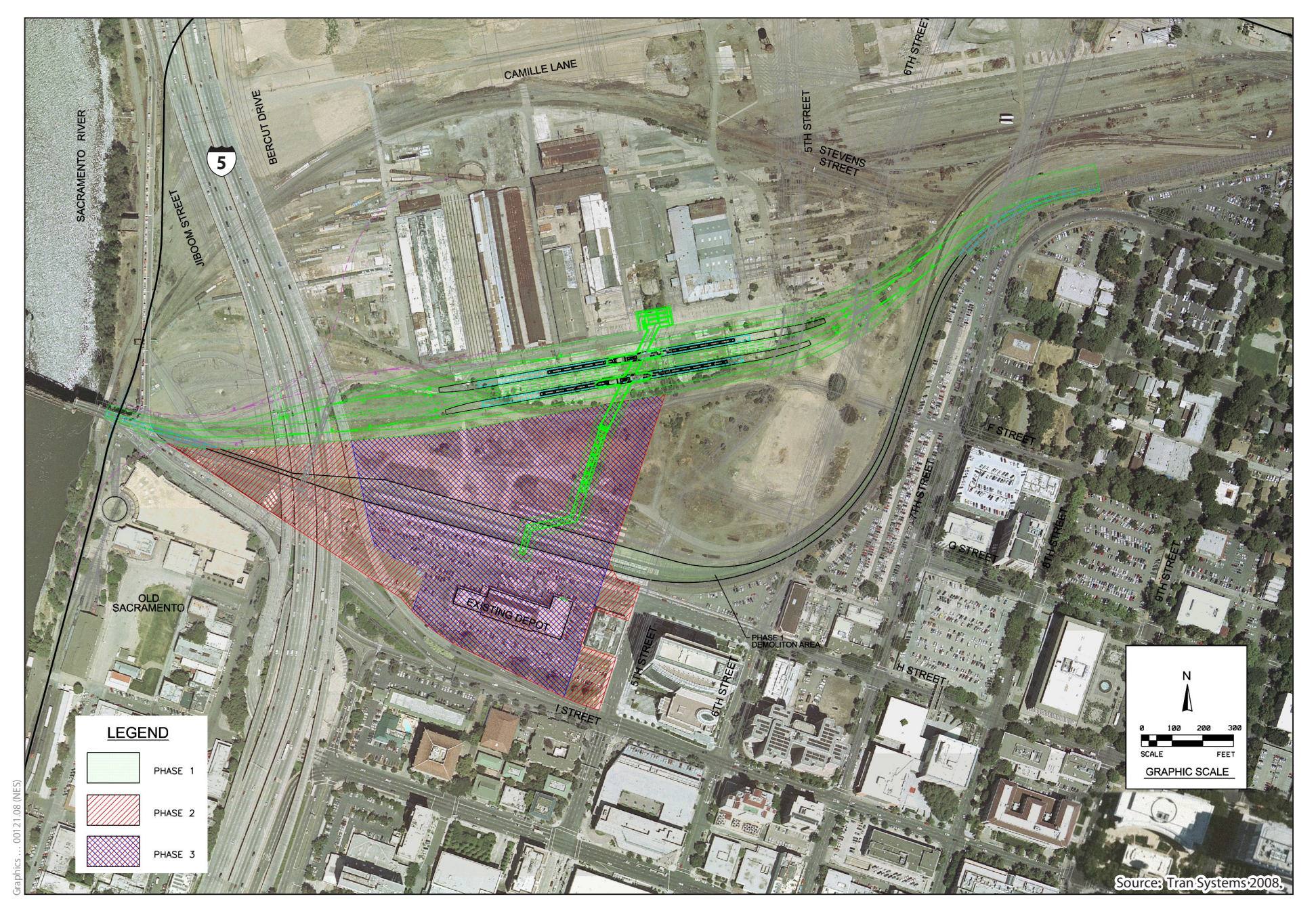
Figure 1-3 Project Composite