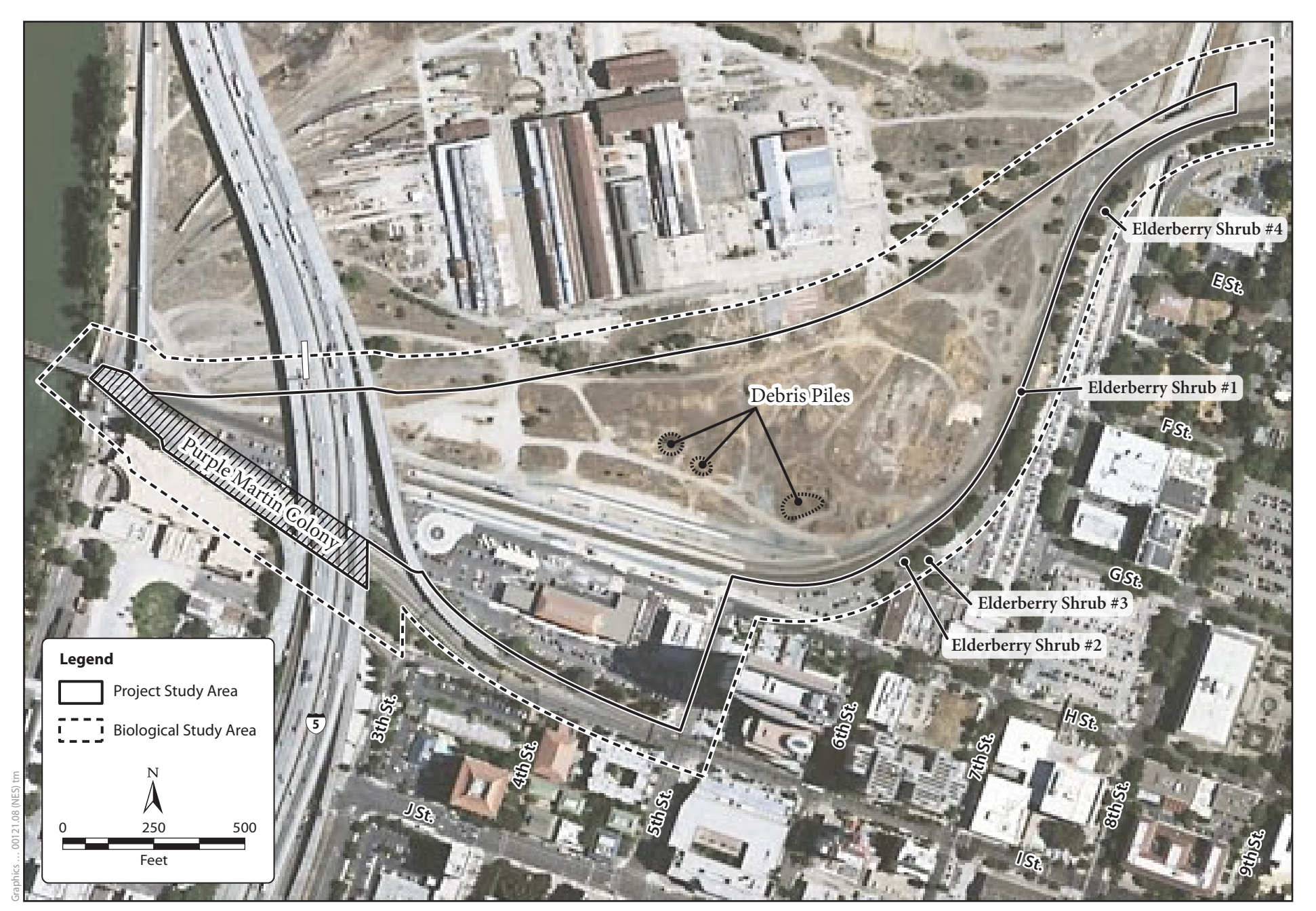
Figure 3-1 Biological Study Area