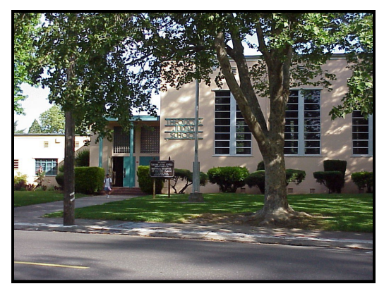
3919 McKinley Boulevard (pictured above)

APN: 004-0111-014 Ord. No. 94-533 Enacted: Aug 30, 1994 Construction Date: 1937-1938