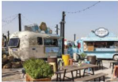
Food Truck and Kiosk Court