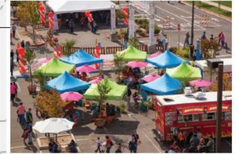
"Park in a Box" installation