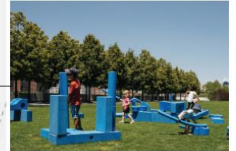
Kids Play Pieces