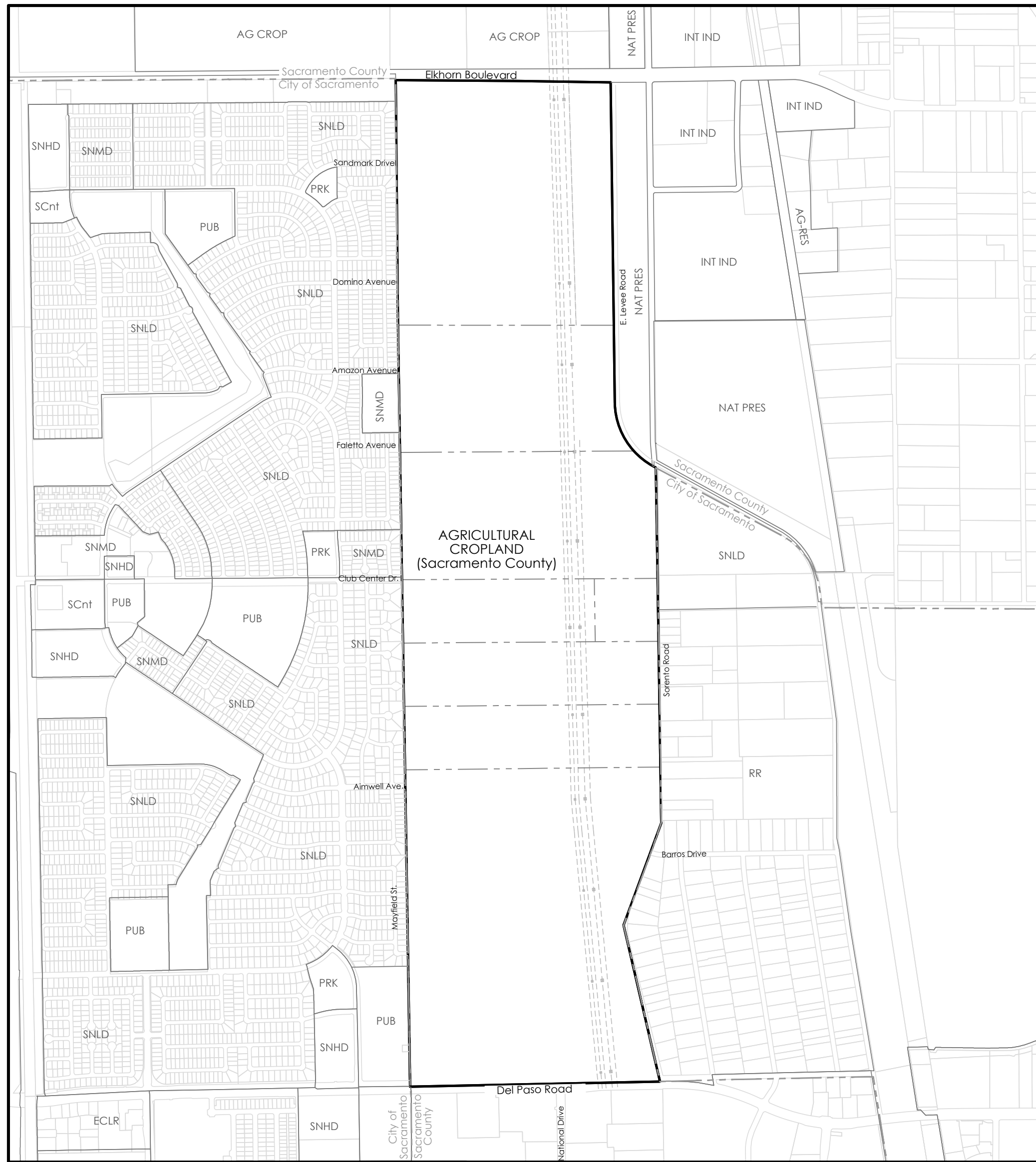
Existing Sacramento County General Plan