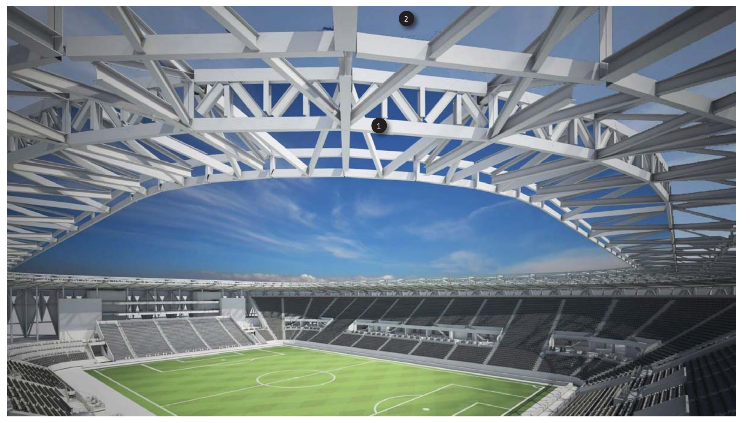
MATERIALS View from Southwest looking Northeast

1 EXPOSED STRUCTURAL STEEL WITH HIGH PERFORMANCE COATING