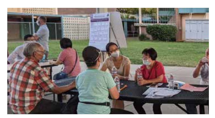
Multilingual Night at Will C. Wood Middle School (September 22nd). The engagement team hosted a multilingual night at Will C. Wood Middle School. Food and raffle prizes were provided at the event, which was attended by 13 community members.