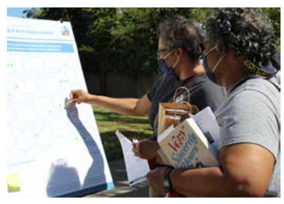
Pop-Up at the Colonial Heights Library