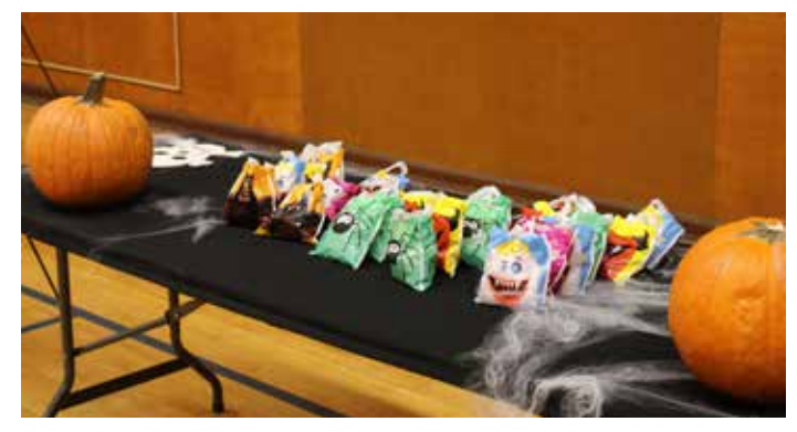
Harvest Festival at the Fruitridge Community Collaborative (October 28th). The engagement team hosted a Harvest Festival for community members with crafts, food, raffle prizes, and a discussion about the future of Stockton Blvd. Six people attended the event at the Fruitridge Community Collaborative.