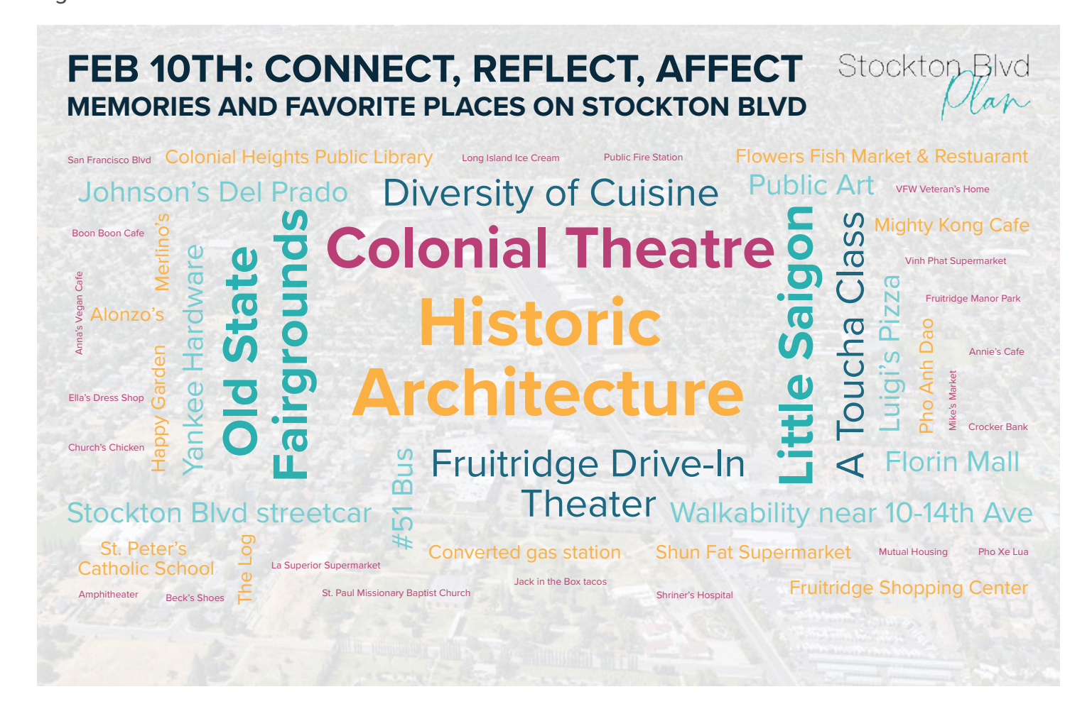
Figure A-6. Mural Board of Visioning Breakout Room Exercise