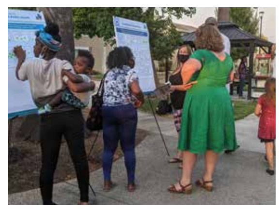
Pop-Up at the Greenway Mutual Housing Apartments