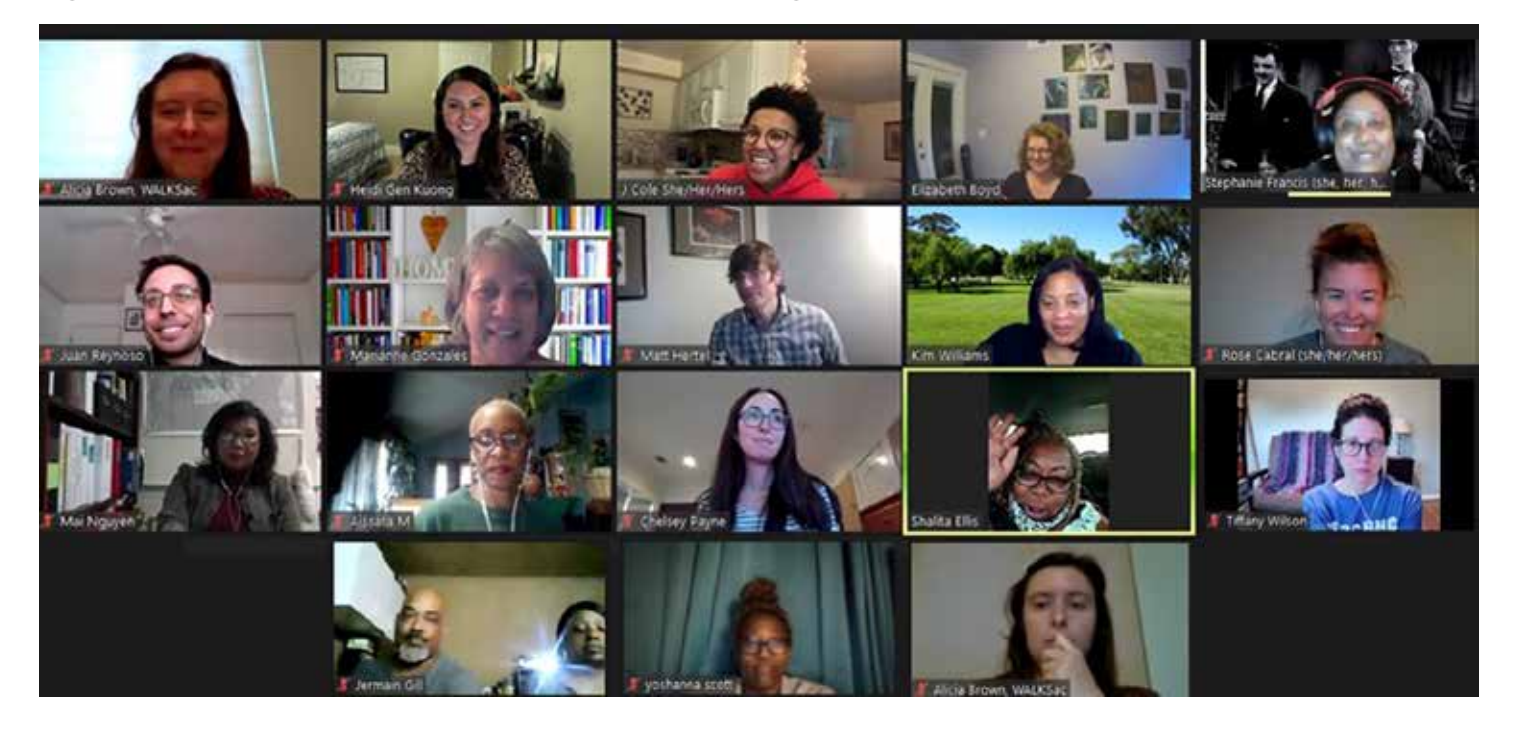
Figure A-1. Screenshot of October 2021 RPT Meeting

The Engagement Team also coordinated community engagement events with the RPT to ensure engagement activities were planned and implemented in a way that was most effective and culturally appropriate, with a goal of reaching traditionally underrepresented groups. The RPT played a large role in the first Community Workshop. Figures A-2 and A-3 show the results of the visioning and favorite memories and palces exercises done with the RPT in advance of the first Community Workshop.