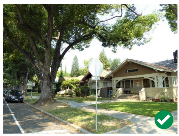
Figure 79. Consistent setbacks, open lawns, and large elms planted in grassy park strips contribute to the overall cohesive character of the historic district.