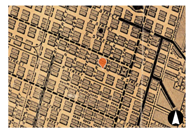
Figure 75. A section of a 1923 map of Sacramento's streetcar lines (dotted lines) and highways (solid line) showing the 2500 block of Q Street at the center with orange marker (1923).

Bungalow Row developed on the city's eastern border, in an area where streetcar service was plentiful. Advertisements for houses in the neighborhood touted their proximity to the "P" line of the streetcar system just one block to the north.<sup>3</sup> Maps show that by 1923, the neighborhood was surrounded by streetcar lines, with additional lines running down 28th, T, and 21st streets, in addition to P Street.<sup>4</sup> One block to the south, the Southern Pacific Railroad's rail line ran down R Street, where a number of industrial businesses, including a lumber mill and construction materials yard, were located.<sup>5</sup> Easy access to streetcars appealed to middle-class homebuyers, who sought