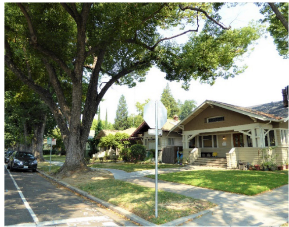
Figure 73. The Bungalow Row Historic District is dominated by Craftsman style bungalows, most of which were built with a uniform setback from the street on Q Street between 25th and 26th streets.

The Bungalow Row Historic District is located within Sacramento's original 1848 street grid and consists of approximately one block of modestly sized Craftsman bungalows on Q Street, roughly bounded by Quill Alley, 25<sup>th</sup> Street, Powerhouse Alley, and 26<sup>th</sup> Street. The larger Winn Park Historic District surrounds the Bungalow Row Historic District to the west, north, and east.