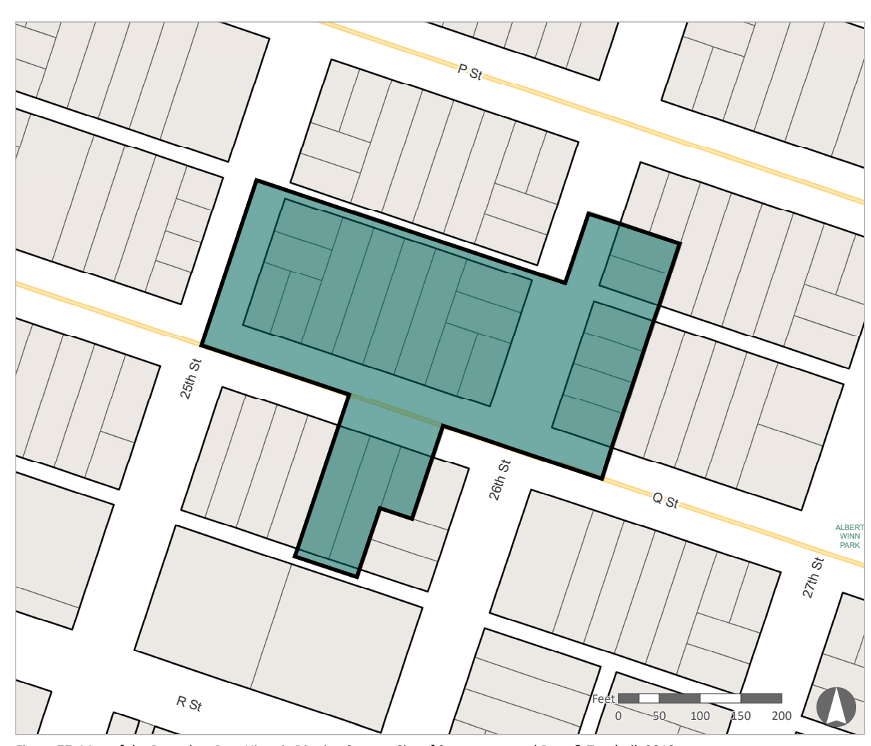
Legend Historic District Boundary

To view the statuses of individual properties as contributing or non-contributing resources to the historic district, refer to the Sacramento Register of Historic and Cultural Resources.