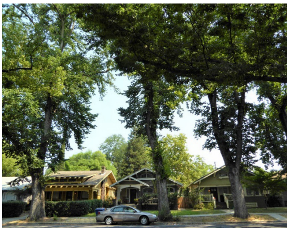
Figure 74. Mature elm trees planted in grassy parking strips create a canopy over Q Street.