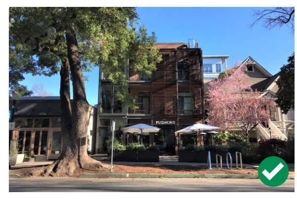
Figure 3. 1813 Capitol Avenue is an example of an infill development that is both compatible with and differentiated from surrounding historic properties in the East End Historic District.

New work should not be so different from the historic features that it becomes the primary focus or visually competes with the contributing resource(s).