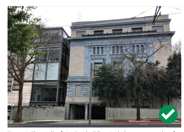
Figure 4. The Hall of Justice building includes an example of a compatible and differentiated addition to a historic building.