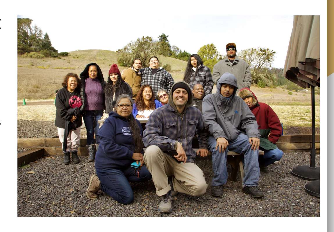
PJ Nursery team on our strategic planning retreat

to empower people impacted by mass incarceration and other social inequities with the skills and resources to cultivate food sovereignty, economic justice and community healing.