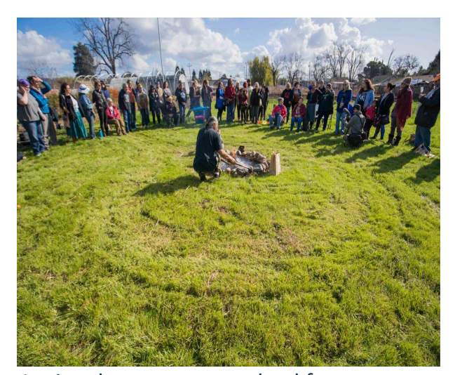
Laying down prayers to heal from the wounds of our colonial legacies